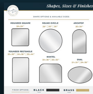
Master & Co.™ E-Commerce Content