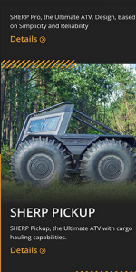
Sherp® Northeast Website Design