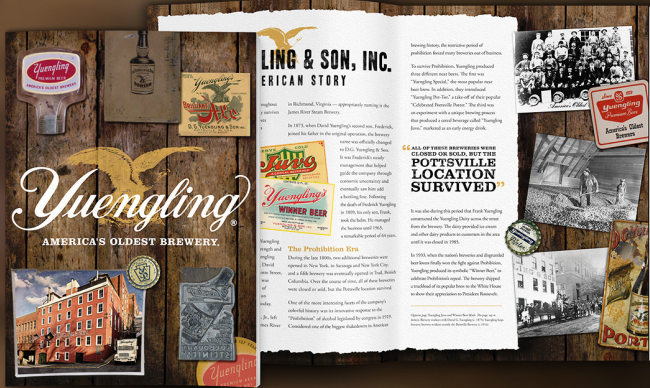
Yuengling® Print Collateral