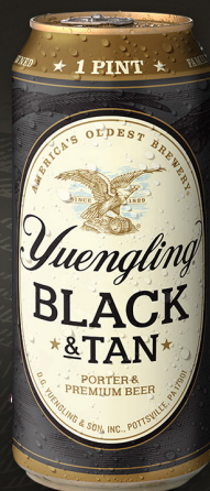
Yuengling® TriBrand Refresh