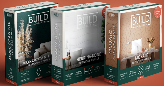
Build and Batten™ Fretwork Packaging