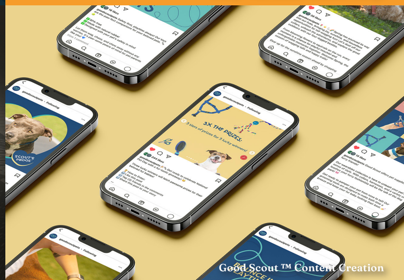
Good Scout™ Content Creation